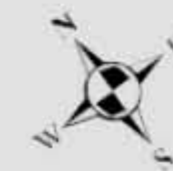
EXHIBIT NO. I