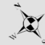
EXHIBIT NO. VI