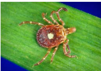
Adult female Lone Star tick

Everyone in our area is aware of the deer tick that carries Lyme and other tick-borne diseases. But do you know about the Lone Star tick? Only recently have Lone Star ticks moved into our area from the south, and they are bringing new, sometimes mysterious diseases with them. The Lone Star tick is much faster than the deer tick and will seek out animals by detecting CO2. One serious consequence is a sudden allergy to red meat. Not everyone gets the meat allergy, however those who do become extremely ill when they ingest beef and it appears the condition can last indefinitely with no known treatment. —Doug Fearn, Lyme Disease Association of SE PA