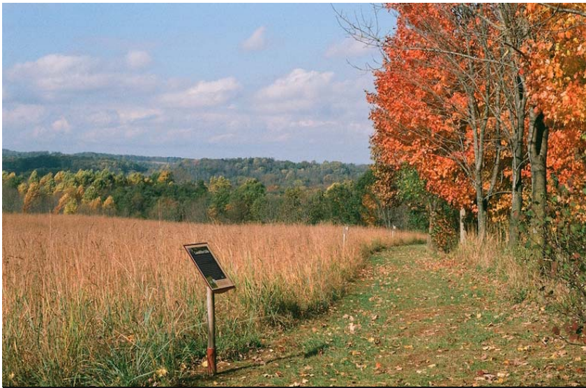
Walking trail at Binky Lee Preserve