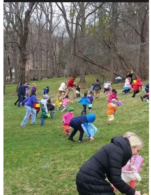
Egg Hunt 2016

Park and Recreation will hold the annual Egg Hunt on Saturday April 8th at the township building for children aged 10 and under. The festivities from 10-11am will include crafts, face painting, pictures with the Easter Bunny, and visiting with bunnies from Pickering Valley Feed & Farm. The Egg Hunt will start promptly at 11am followed by a finale with Grandpop Bubbles until noon. We look forward to seeing you at this fun filled community event!