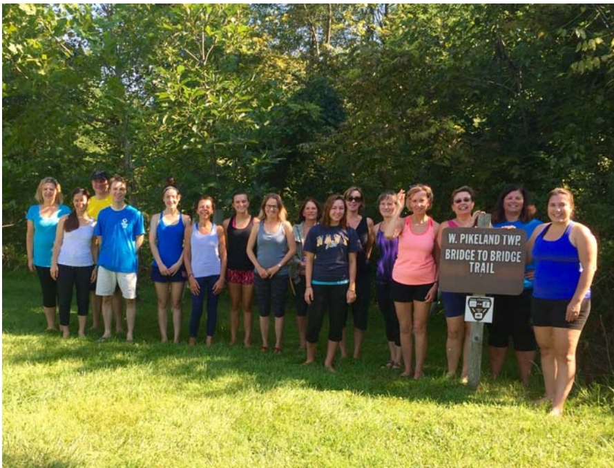
Summer Yoga in the Park Series 2016